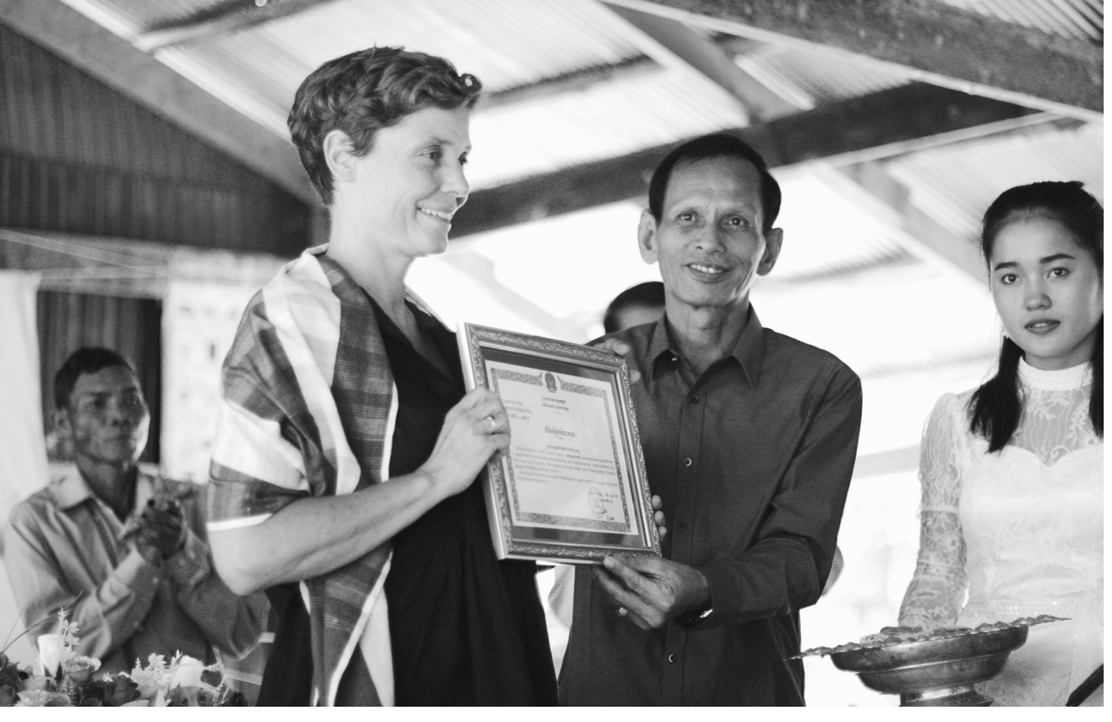
Opening ceremony of Bech Khlok primary school